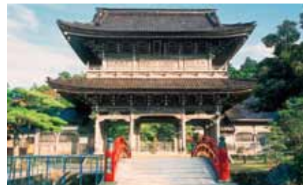
Soujiji Temple (総持寺)

山中、山代、片山津、粟津からなる加賀温泉郷は和倉温泉とともに全国有数の温泉地として快適な宿泊施設とゆきとどいたサービスで、年間220万人以上の温泉客をもてなしています。温泉地の周辺には、越前加賀海岸国定公園、那谷寺、ゴルフ場等があり、九谷焼、山中漆器などの伝統産業と一体となった一大観光地を形成しています。