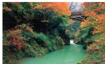
Kakusenkei Gorge (鶴仙溪)