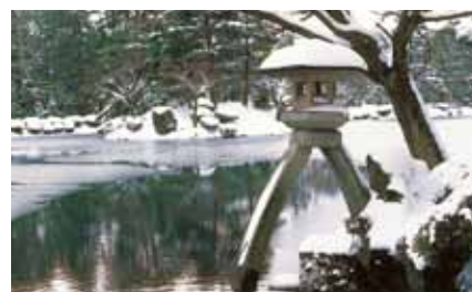
Kenrokuen Garden (兼六園)