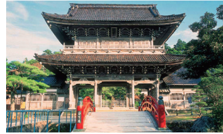
Soujiji Temple (総持寺)

山中、山代、片山津、粟津からなる加賀温泉郷は和倉温泉とともに全国有数の温泉地として快適な宿泊施設とゆきとどいたサービスで、年間215万人以上の温泉客をもてなしています。温泉地の周辺には、越前加賀海岸国定公園、那谷寺、ゴルフ場等があり、九谷焼、山中漆器などの伝統産業と一体となった一大観光地を形成しています。