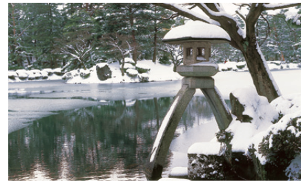
Kenrokuen Garden (兼六園)