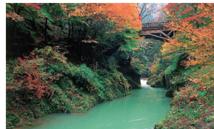
Kakusenkei Gorge (鶴仙溪)