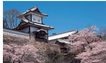
Kanazawa Castle (金沢城)