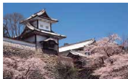
Kanazawa Castle (金沢城)