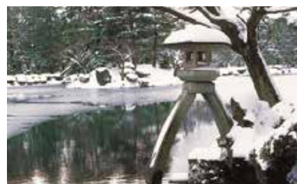
Kenrokuen Garden (兼六園)