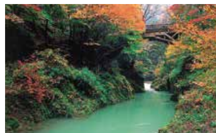
Kakusenkei Gorge (鶴仙溪)