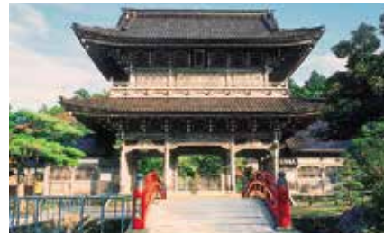
Soujiji Temple (総持寺)

山中、山代、片山津、粟津からなる加賀温泉郷は和倉温泉とともに全国有数の温泉地として快適な宿泊施設とゆきとどいたサービスで、年間184万人以上の温泉客をもてなしています。温泉地の周辺には、越前加賀海岸国定公園、那谷寺、ゴルフ場等があり、九谷焼、山中漆器などの伝統産業と一体となった一大観光地を形成しています。