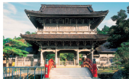
Soujiji Temple (総持寺)

山中、山代、片山津、粟津からなる加賀温泉郷は和倉温泉とともに全国有数の温泉地として快適な宿泊施設とゆきとどいたサービスで、年間200万人以上の温泉客をもてなしています。温泉地の周辺には、越前加賀海岸国定公園、那谷寺、ゴルフ場等があり、九谷焼、山中漆器などの伝統産業と一体となった一大観光地を形成しています。