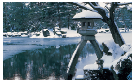
Kenrokuen Garden (兼六園)