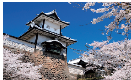
Kanazawa Castle (金沢城)