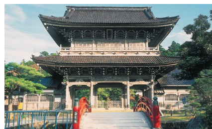
Sōji-ji Soin Temple (總持寺祖院)

山中、山代、片山津、粟津からなる加賀温泉郷は和倉温泉とともに全国有数の温泉地として快適な宿泊施設とゆきとどいたサービスで、年間190万人以上の温泉客をもてなしています。温泉地の周辺には、越前加賀海岸国定公園、那谷寺、ゴルフ場等があり、九谷焼、山中漆器などの伝統産業と一体となった一大観光地を形成しています。