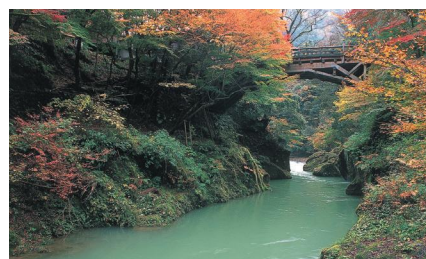
Kakusenkei Gorge (鶴仙溪)