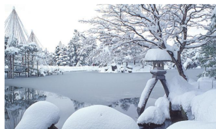
Kenrokuen Garden (兼六園)