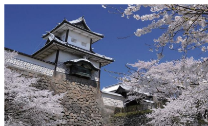
Kanazawa Castle (金沢城)