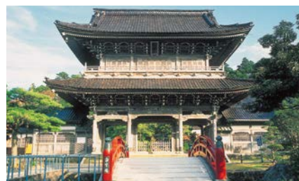
Sōji-ji Soin Temple (總持寺祖院)

山中、山代、片山津、粟津からなる加賀温泉郷は和倉温泉とともに全国有数の温泉地として快適な宿泊施設とゆきとどいたサービスで、年間188万人の温泉客をもてなしています。温泉地の周辺には、越前加賀海岸国定公園、那谷寺、ゴルフ場等があり、九谷焼、山中漆器などの伝統産業と一体となった一大観光地を形成しています。