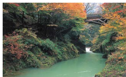
Kakusenkei Gorge (鶴仙溪)