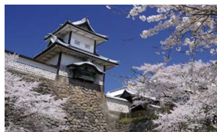
Kanazawa Castle (金沢城)