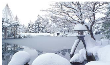
Kenrokuen Garden (兼六園)