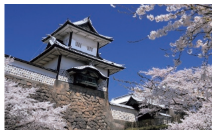
Kanazawa Castle (金沢城)