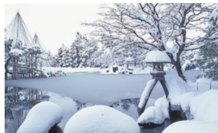
Kenrokuen Garden (兼六園)