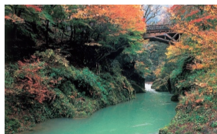
Kakusenkei Gorge (鶴仙溪)