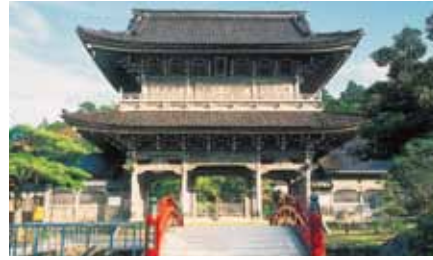
Soujiji Temple (総持寺)

山中、山代、片山津、栗津からなる加賀温泉郷は和倉温泉とともに全国有数の温泉地として快適な宿泊施設とゆきとどいたサービスで、年間220万人以上の温泉客をもてなしています。温泉地の周辺には、越前加賀海岸国定公園、那谷寺、ゴルフ場等があり、九谷焼、山中漆器などの伝統産業と一体となった一大観光地を形成しています。