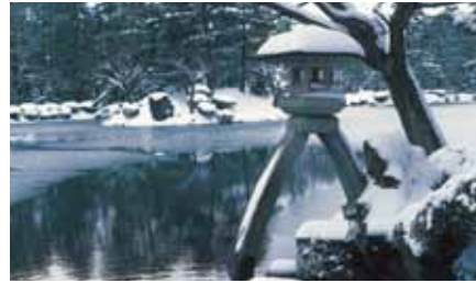
Kenrokuen Garden (兼六園)