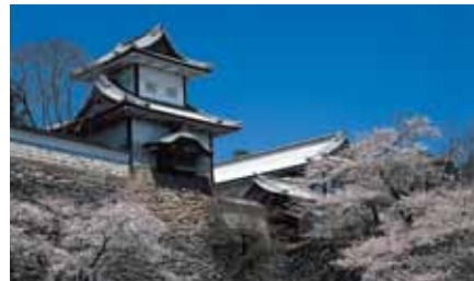
Kanazawa Castle (金沢城)