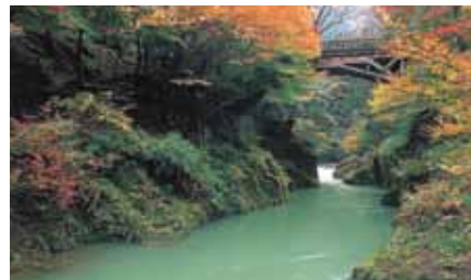
Kakusenkei Gorge (鶴仙溪)