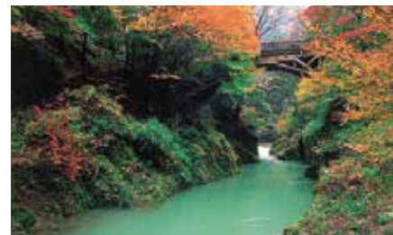
Kakusenkei Gorge (鶴仙溪)

本県には、豊かな自然や伝統文化など、魅力ある観光資源が数多くあり、2013年には2,163万2千人の観光客が訪れています。