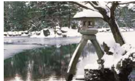
Kenrokuen Garden (兼六園)