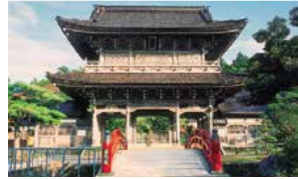
Soujiji Temple (総持寺)

The four hot spring towns of Yamanaka Onsen, Yamashiro Onsen, Katayamazu Onsen, and Awazu Onsen make up the Kaga Hot Springs District, which, along with Wakura Onsen, is one of the most well-known hot springs districts in Japan. Famous for their comfortable accommodations and high-quality customer service, these hot springs attract over 2.07 million visitors every year. The hot springs district and the surrounding area form a major tourist destination, which also offers a number of other attractions, such as the Echizen Kaga Coast Quasi-National Park, Natadera Temple, golf courses, and a variety of traditional craft industries like Yamanaka lacquerware and Kutani pottery.