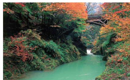
Kakusenkei Gorge (鶴仙溪)