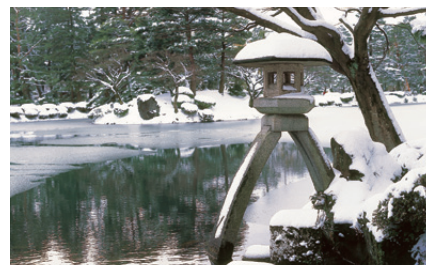
Kenrokuen Garden (兼六園)