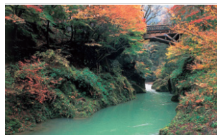
Kakusenkei Gorge (鶴仙溪)