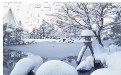
Kenrokuen Garden (兼六園)