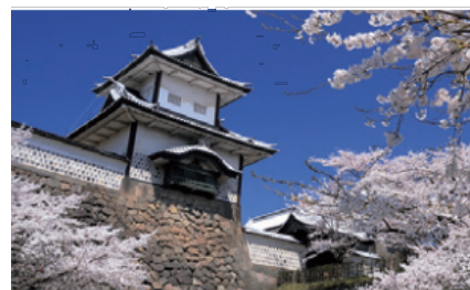
Kanazawa Castle (金沢城)