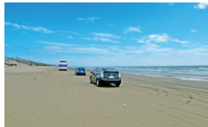
Chirihama Nagisa Driveway (千里浜なぎさドライブウェイ)

山中、山代、片山津、粟津からなる加賀温泉郷は和倉温泉とともに全国有数の温泉地として快適な宿泊施設とゆきとどいたサービスで、年間124万人の温泉客をもてなしています。温泉地の周辺には、越前加賀海岸国立公園、那谷寺、ゴルフ場等があり、九谷焼、山中漆器などの伝統産業と一体となった一大観光地を形成しています。