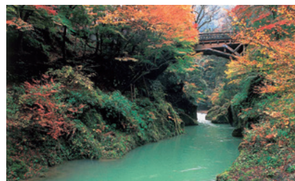
Kakusenkei Gorge (鶴仙溪)